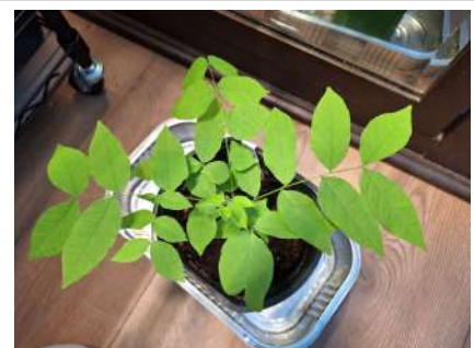
Kentucky Coffee Tree by Alison Babin

Interested in volunteering or donating plants? Keep an eye for upcoming sign-up sheets. We can't wait to see our community come together to make this our best sale yet!