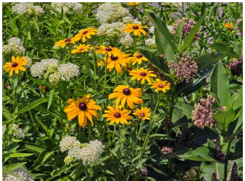
Milkweeds and Rudbeckia hirta at Gold Point, July 2025