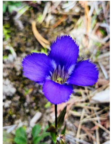
Gentianopsis at Heber Down, September 2023

Finally, while we're waiting for the Oshawa gardens to bloom, let's all put on our boots and enjoy wintery weekend hikes at one of the local conservation areas. Feeding the songbirds at Lynde Shores is a fun winter activity. When spring arrives, Stephen's Gulch in Bowmanville is an absolute gem for spring-blooming ephemerals - trilliums galore, plus many others. One of my all-time favourite plants is the gentian ( Gentiana sp.); we were very pleased to discover the related native Gentianopsis crinita blooming at Heber Down in Whitby a couple of summers ago. Something about the typical purple-blue flower colour and their shape draws me in. All our local conservation areas have much to offer.