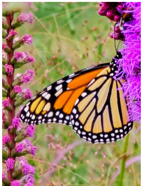
Monarch on Liatris at City Hall, August 2025

Some exciting news from the City of Oshawa Parks to share with you all: